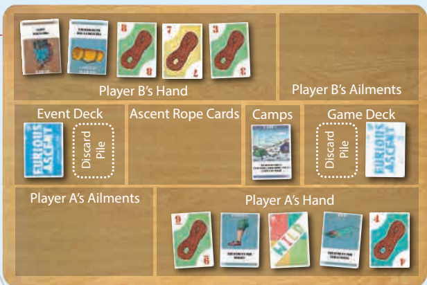
Figure 1 - Table layout after deal in a 2-player game.

The Game and Event Decks are shuffled and in place, as is the Camp 1 card with the instructions for the first ascent. Players A and B have been dealt their hands which are placed face up on the table with an area to the left for any ailment cards they draw. The Rope and Wild cards for the next ascent will be placed in the area aside the Ascent card.