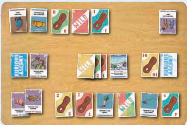
Figure 2 - Table layout later in the game.

Later in the game, as seen in Figure 2, the players have played three cards toward their current ascent to Camp 2. Player A, at the bottom, has 30 points of accumulated ailments, while Player B has 20 points. Player A has drawn already for his or her turn, and has several play options: play the blue 4 Rope card toward the ascent, play the multicolored Wild card (as a 4) toward the ascent, play the blue 4 Rope card and then the multicolored Wild card (as a 5) toward the ascent, and/or play the Rest Treatment card to remove the ailment on Player B. Player A may choose to make one or more of these plays or none of these plays. If player A decides not to make progress toward the ascent objective, however, he or she must discard down to five cards and then end his or her turn by drawing an event card.